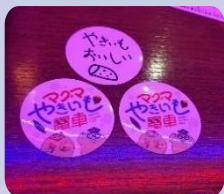
Commemorative quiz stickers