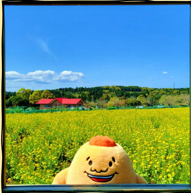
Rikinon enjoyed the flowers too 🎵

We took Rikinon, one of Kagoshima City's Magnion characters, with us to enjoy the rapeseed flowers in the "Four Seasons Flower Garden" 🌸