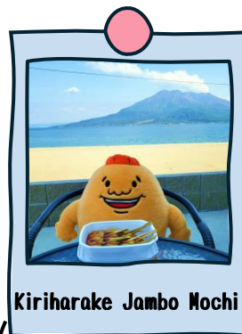
Kiriharake Jambo Mochi

The name for this famous Kagoshima mochi comes from the kanji 両棒 (two sticks) and not the English word "jumbo." This treat consists of well-cooked mochi covered with thick sweet soy sauce, eaten with two sticks. Please try it if you haven't had the chance to!