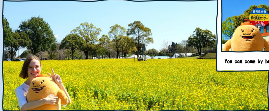
You can come by bus!

I was moved at how big the flower field is!